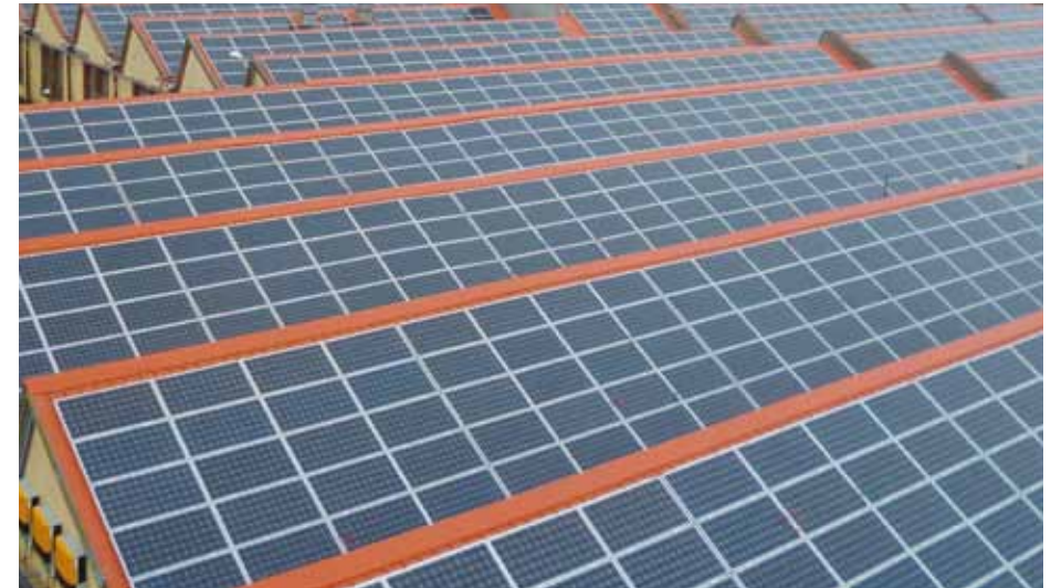
Cernay - France System: 1,136 MW | SpeedRail with AddOn