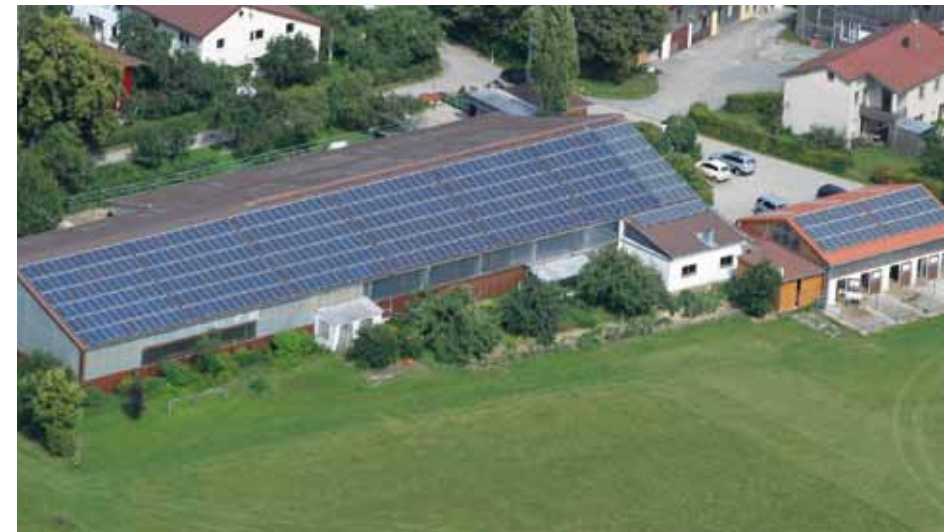
Gäufelden-Nebringen - Germany System: 31,85 kW | SpeedRail